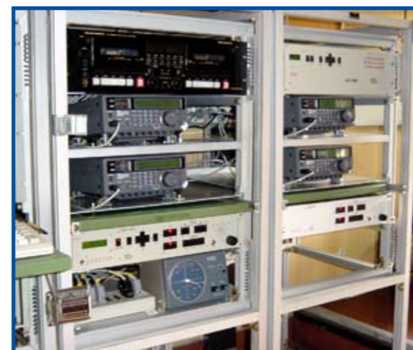
HF/VHF/UHF Radio Monitoring and Signal Analysis System