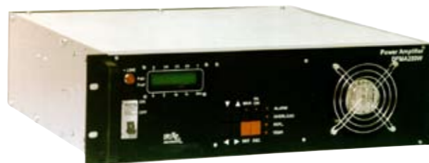
VHF/UHF Power Amplifier