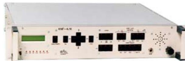
IF and Audio Signal Switching Unit