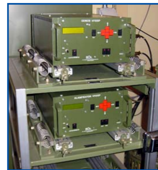
HF Radio Signal Classifier and HF GEMOS