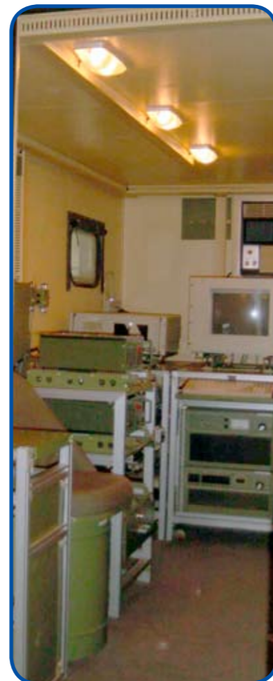
1 kW HF Jammer