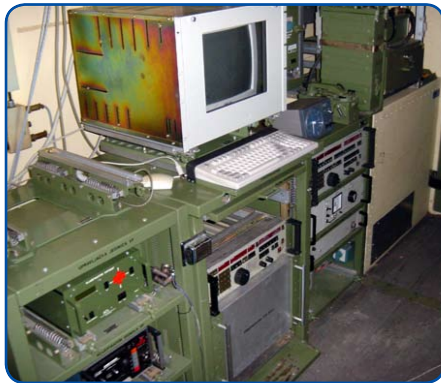
1 kW VHF/UHF Jammer