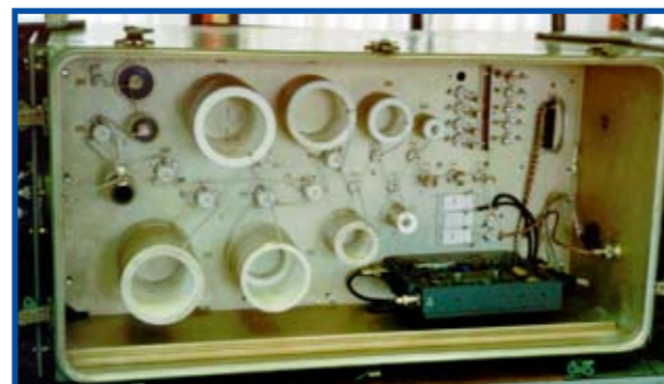
Fast 1 kW HF Antenna Tuner