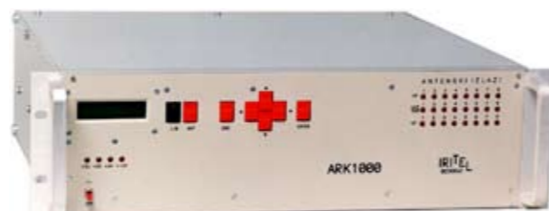
VHF/UHF Antenna Multi-coupler