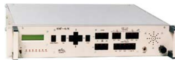
Audio distribution unit KNF-4/K