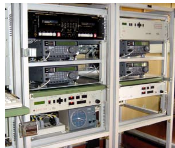
Radio Monitoring and Technical Analysis System RMTA-1004