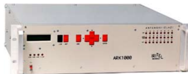
Antenna distribution unit ARK-1000

KNF-4 and KNF-4/K are also connected with antenna distribution unit ARK-1000. This connections enables the operator to select antenna inputs for two receivers by front panel keyboard of KNF-4.